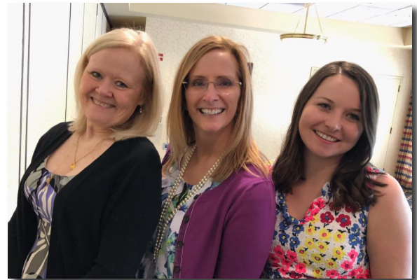
AGD International Reunion Day April 2019