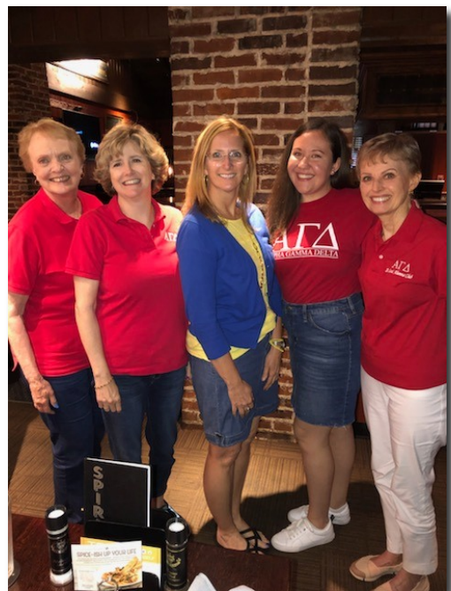
Alpha Gams Night Out May 2019